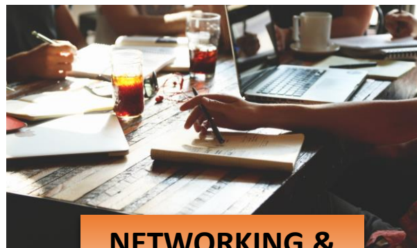
NETWORKING & COLLABORATION